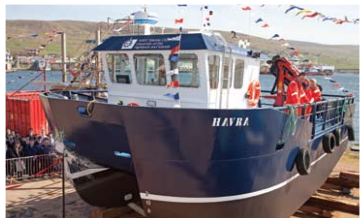
The champagne bottle breaks on the bow.

This vessel was wholly funded by a £380,000 grant from Shetland Islands Council Economic Development Unit.